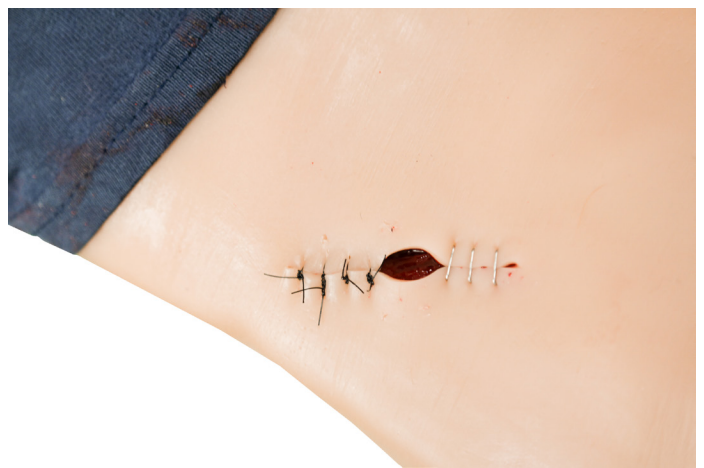
SUTURE / STAPLE PLACEMENT